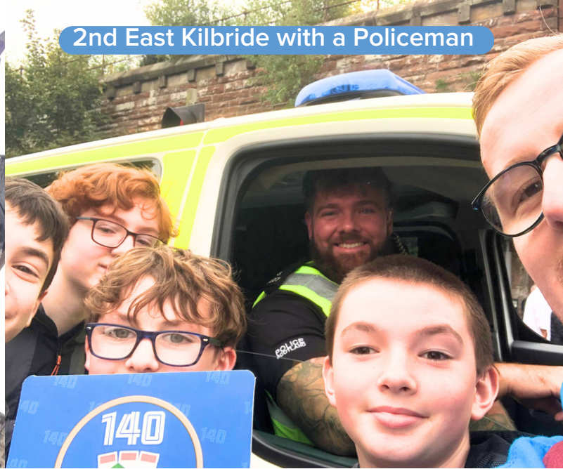
2nd East Kilbride with a Policeman