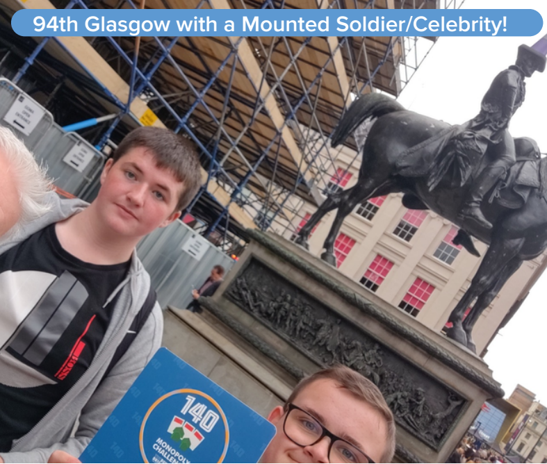
94th Glasgow with a Mounted Soldier/Celebrity!