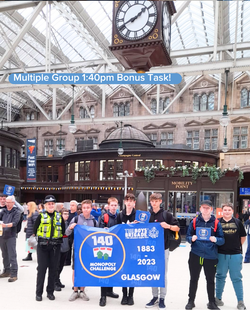
Multiple Group 1:40pm Bonus Task!