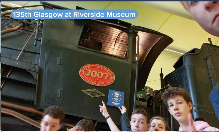
135th Glasgow at Riverside Museum