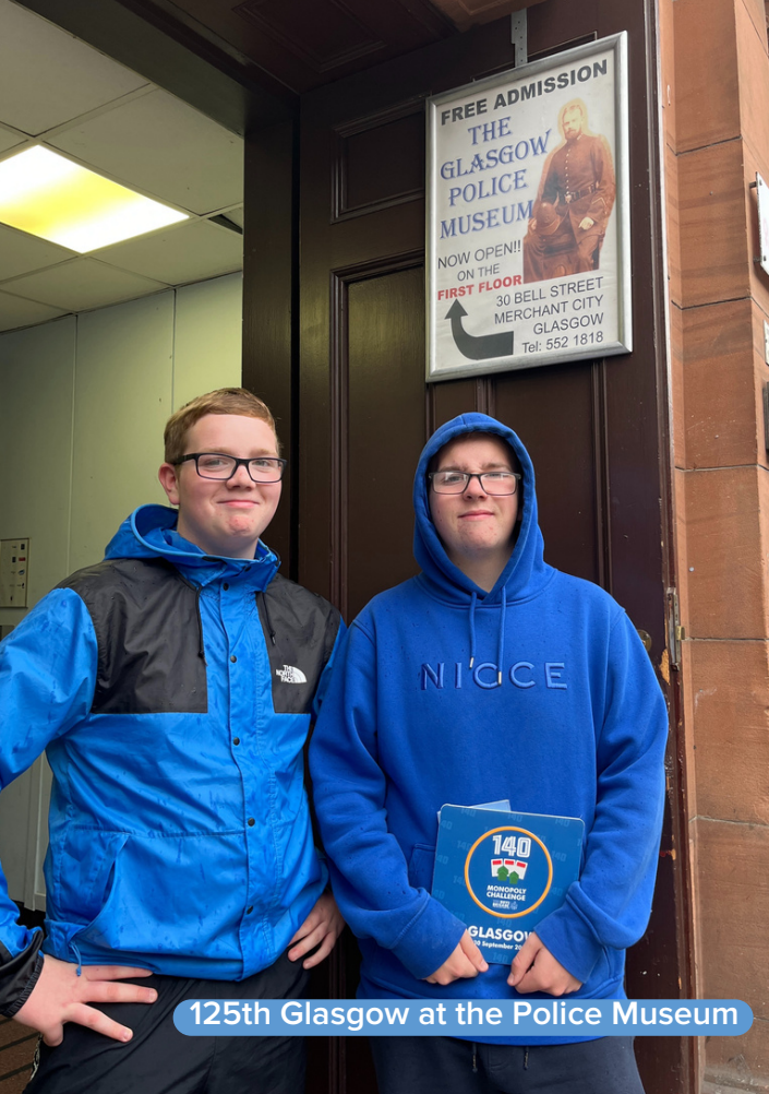
125th Glasgow at the Police Museum