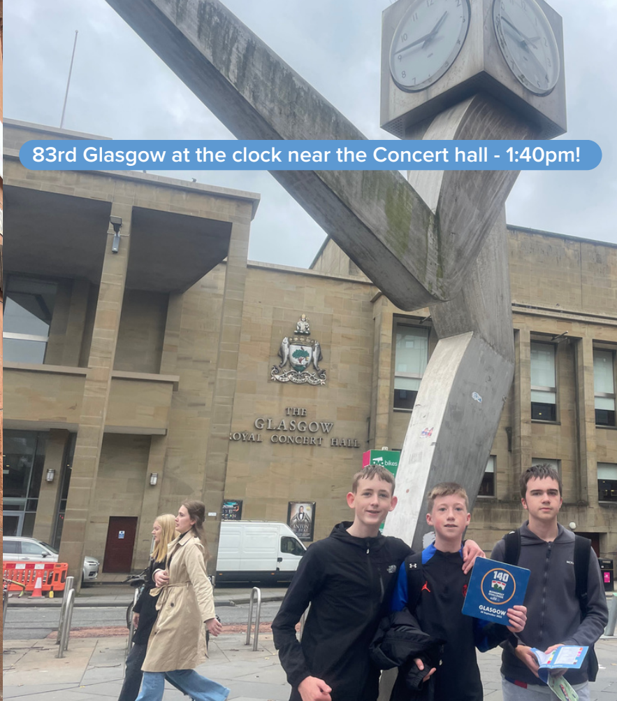
83rd Glasgow at the clock near the Concert hall - 1:40pm!