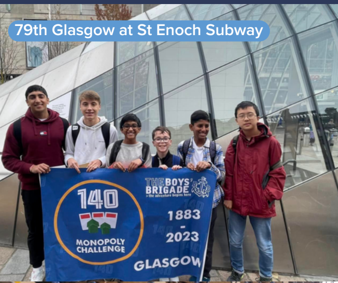
79th Glasgow at St Enoch Subway