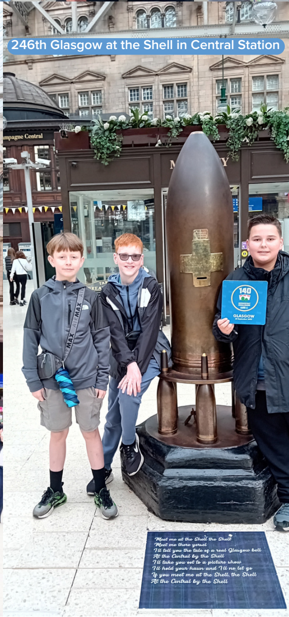
246th Glasgow at the Shell in Central Station

Meet me at the Shell the Shell Meet me twice yearly I'll tell you the tale of a real Glasgow bell At the Central by the Shell I'll take you out to a picture show I'll hold your hands and I'll let you go If you meet me at the Shell the Shell At the Central by the Shell